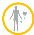
DONOR LYMPHOCYTE INFUSION