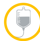
UNIT CORD BLOOD