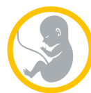
MESENCHYMAL STEM (UMBILICAL)