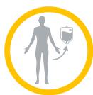
DONOR LYMPHOCYTE T-CELLS