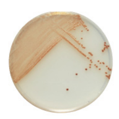
CAMPYFOOD Agar Method (CFA) AOAC PTM 071201 Item# 43471