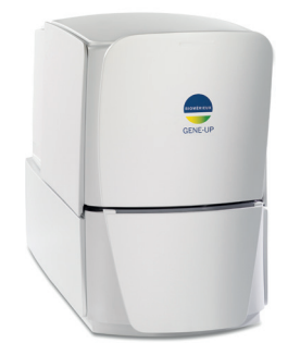
GENE-UP CAM AOAC PTM 012202 Item# IS1100