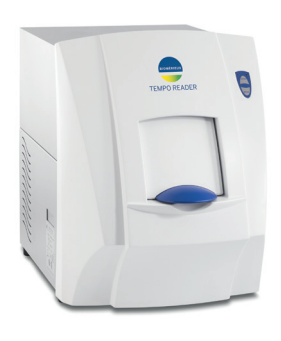
TEMPO CAM AOAC PTM 112002 Item# 421509